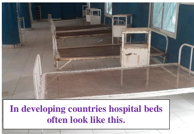
In developing countries hospital beds often look like this.

The Adopt a Bed Program is one of the easiest and most cost effective International Projects your Club can adopt.